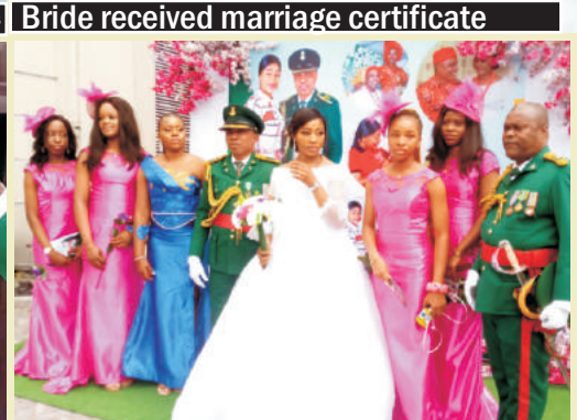
Couple with the bridal train