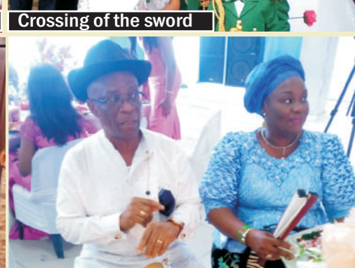
Sir & lady Ikuru