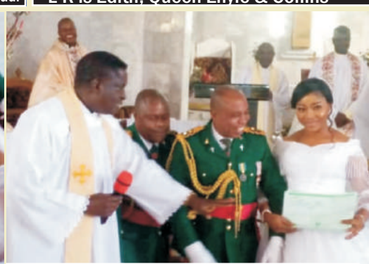
Bride received marriage certificate