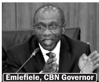
Emefiele, CBN Governor