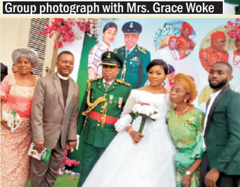
Couple with bride's family