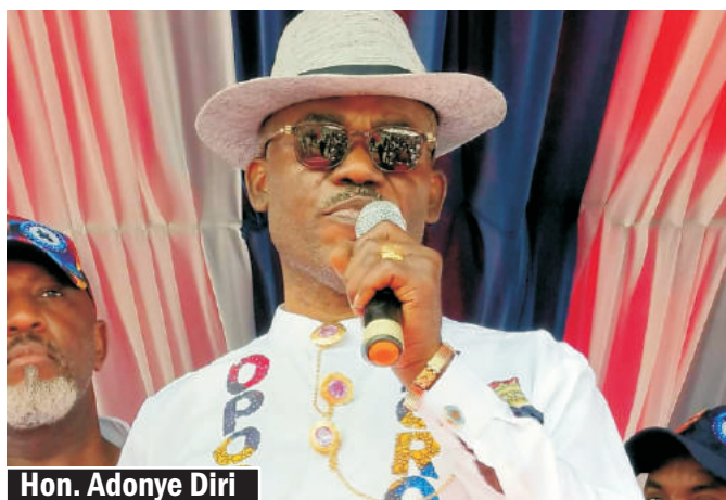
Hon. Adonye Diri