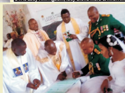
Signing of the marriage register. Couple surrounded by military ministers