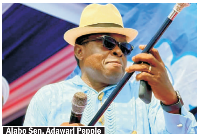
Alabo Sen. Adawari Pepple