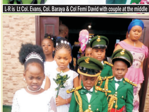
Page boys & little brides