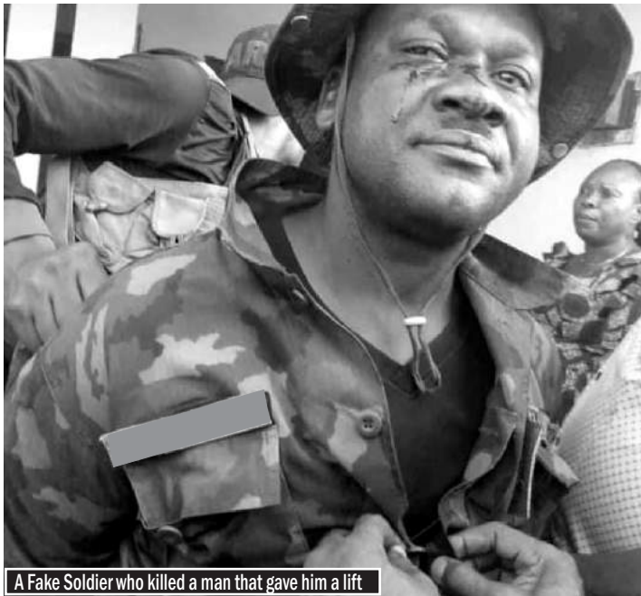
A Fake Soldier who killed a man that gave him a lift

officers and other law enforcement officers doing their legitimate duties on our roads. There was one such incident where a dismissed soldier complained that he went off duty to reactivate his medically prescribed inhaler which as an asthmatic patient, he ought not to lack, but got fired immediately his absence was felt. Maybe that was not the true story but it became obvious to see such a confession from some military officers who were dismissed from service