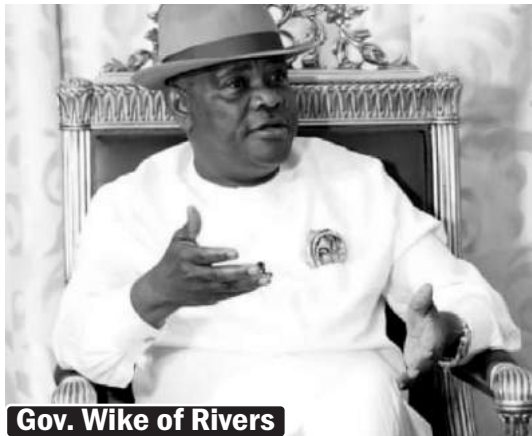
Gov. Wike of Rivers

unbelievable that Dakuku, who got a contract for Opobo shore protection and embezzled funds, could still have the audacity to accuse the Wike's administration that has linked the entire Opobo/Nkoro island to the rest of the State by road, of doing nothing for the council.