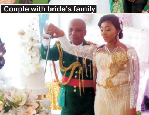
Cutting of the cake with the sword