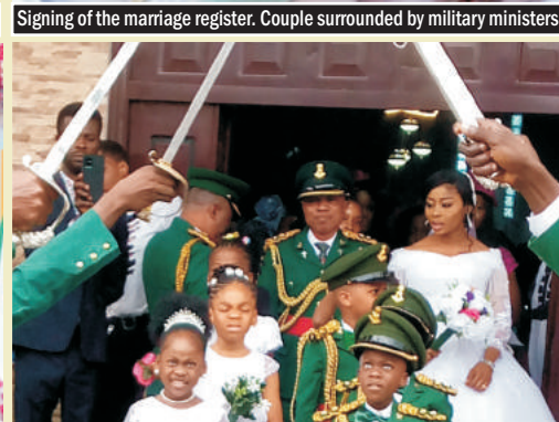
Crossing of the sword