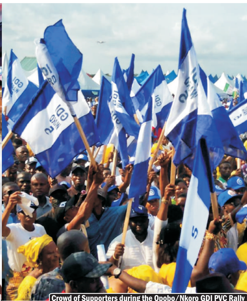
Crowd of Supporters during the Opobo/Nkoro GDI PVC Rally